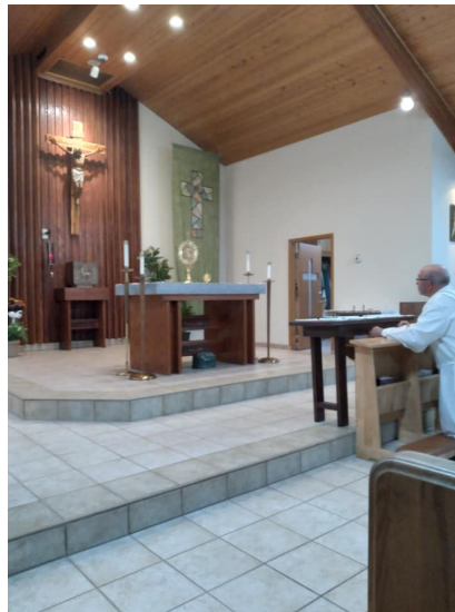
Sanctuary at St. John the Baptist, Custer

Ordinary Time Sing Along: Sing with friends and colleagues, getting a glimpse of other parishes’ favorite Ordinary Time hymns.