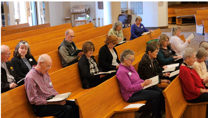
Left, top and bottom: participants sing during morning session on "New Music in Breaking Bread."

Musicians from Blessed Sacrament, Rapid City led Closing Prayer.