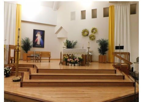
Sanctuary at St. Francis, Sturgis