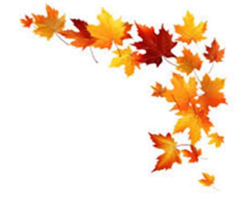
Saint Cecilia, Pray for us.