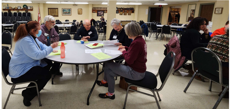
Small groups discuss “The Seven Deadly Sins for Music Ministry Members.”