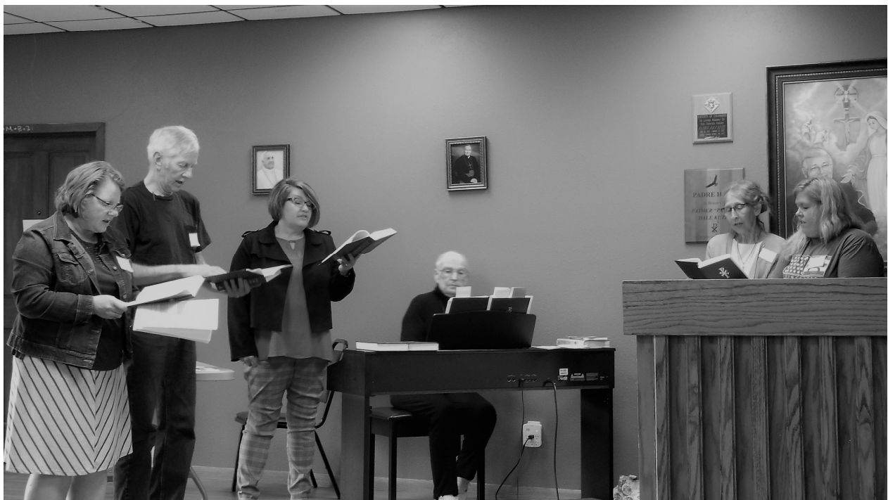
Above: Opening Prayer, led by musicians from St. John the Evangelist Church

St. John the Evangelist Church’s centralized location in the state afforded us the rare and exciting opportunity to connect with our musical counterparts from not only across the diocese, but across the entire state! As such, this marked the first time that nearly half of our total meeting attendees came from East River parishes! It resulted in a wonderful day of making new acquaintances, sharing common experiences, and learning valuable insights from all in attendance.