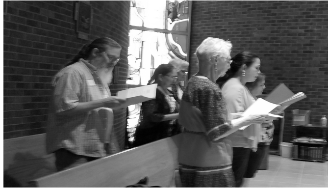
~Musicians from St. Isaac Jogues Church lead opening prayer

Now, our Fall Meeting and St. Cecilia Banquet/30 th Anniversary celebration is just around the corner! In this newsletter is