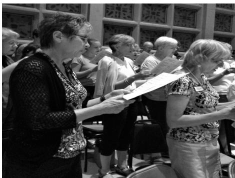
2016 Choir Festival (OLPH)

This will be an enormously informative, uplifting, and entertaining weekend. What a wonderful way to celebrate our chapter’s 30 th anniversary! We hope you will be able to come!