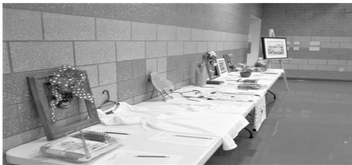
2018 Silent Auction

Email a description (and photo if possible) of the auction item(s) you intend to bring to the auction to Carman Timmerman at carmantimmerman@gmail.com .