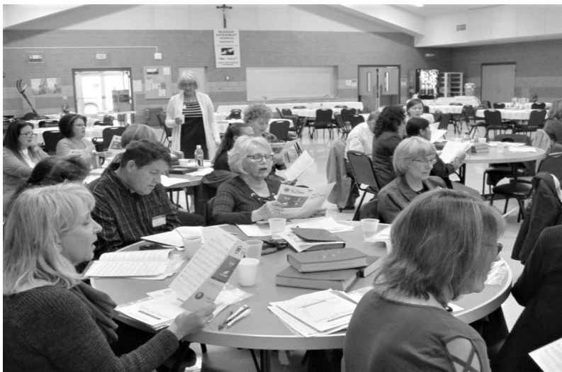
2018 Fall Meeting (BSC)