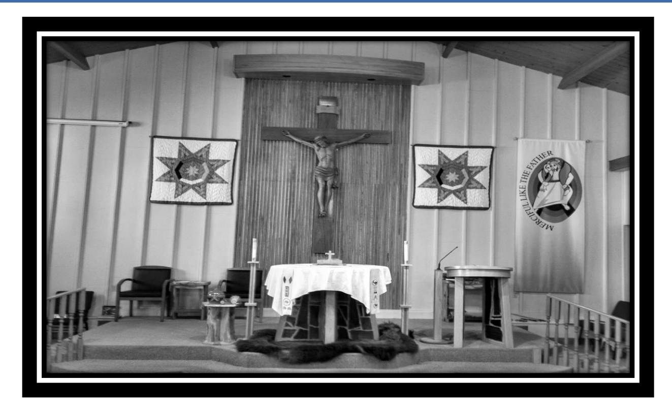
2018 NPM WINTER MEETING EVALUATION RESULTS Saturday, January 27, 2018 St. Isaac Jogues Church, Rapid City, SD

Number of Respondents = 12, Percentage of Meeting Attendees Respondents = 54.5% (12/23)