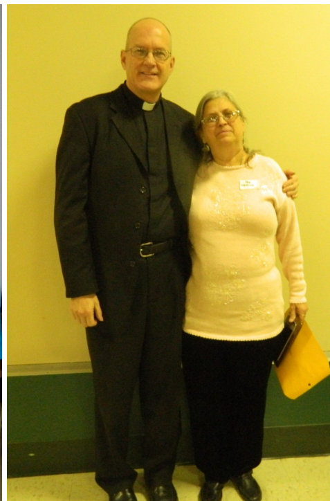
St. Cecilia Award for Laity