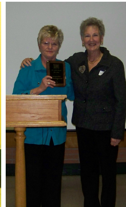
St. Cecilia Award for Laity